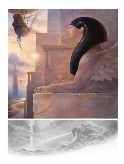
14. THE EDGE OF THE WORLD OK

Portrait format. Signed, not dated. 2016